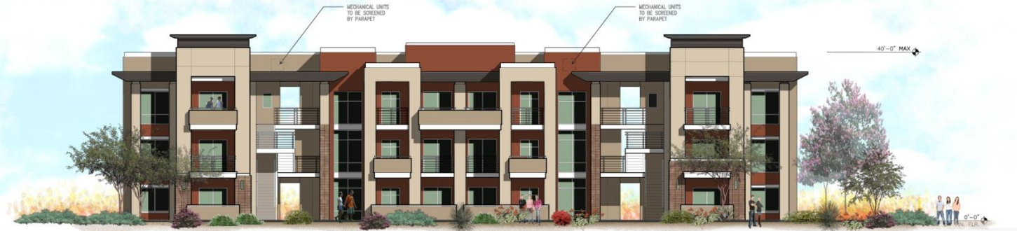
FRONT AND REAR ELEVATION

Contractor must verify all dimensions of project before proceeding with this work. Do not reference these drawings and specifications without the express written permission of the Architect. The drawings and specifications are instruments of service and shall remain the property of the Architect whether or not they are used in whole or in part. These drawings and specifications shall not be used for purposes other than those intended for this project, or for completion of the project by other means, without the express written permission of the Architect. © Copyright WhitneyBell Architects Inc. 2012