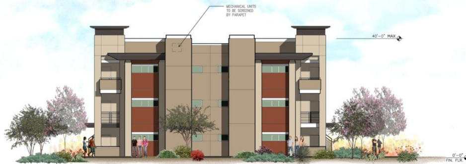
LEFT AND RIGHT ELEVATION

BUILDING TYPE 4 SCALE: 1/8" = 1'-0" 0' 5' 10'